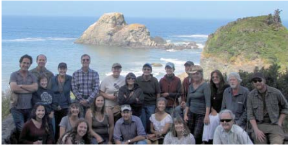
2015 Big Day on the Land gathering at Houda Point